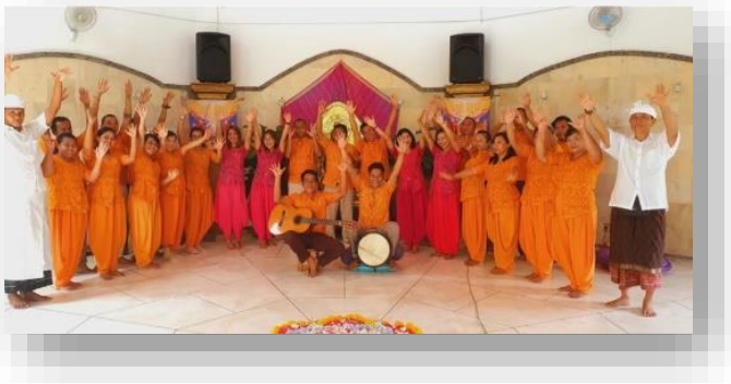
Your Shambala Team

We are looking forward to working with you and helping you make your stay with us at Shambala in Bali a Dream Come True!